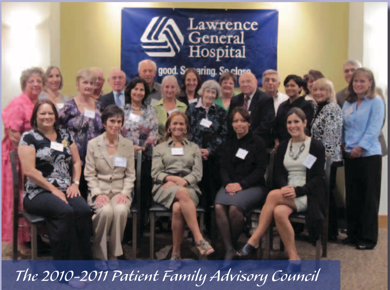
The 2010-2011 Patient Family Advisory Council