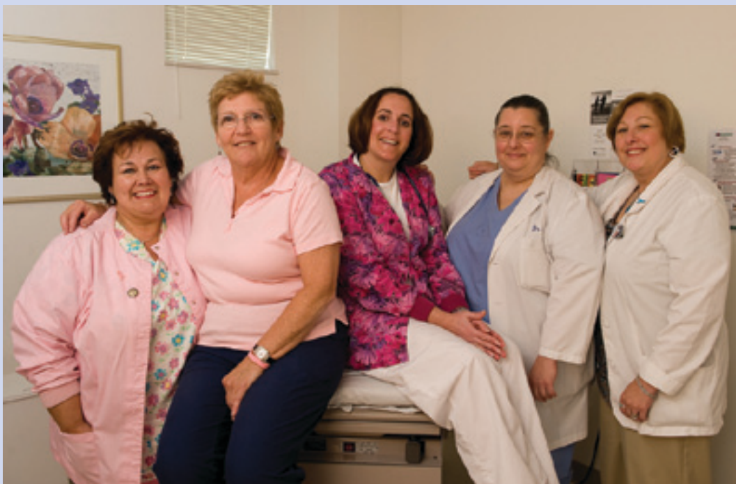
Our breast center's surgeons, radiologists, mammography technologists and registered nurses work together with patients to ensure maximum breast health.

To schedule an appointment or receive more information or a free brochure, please call 508-235-5353.