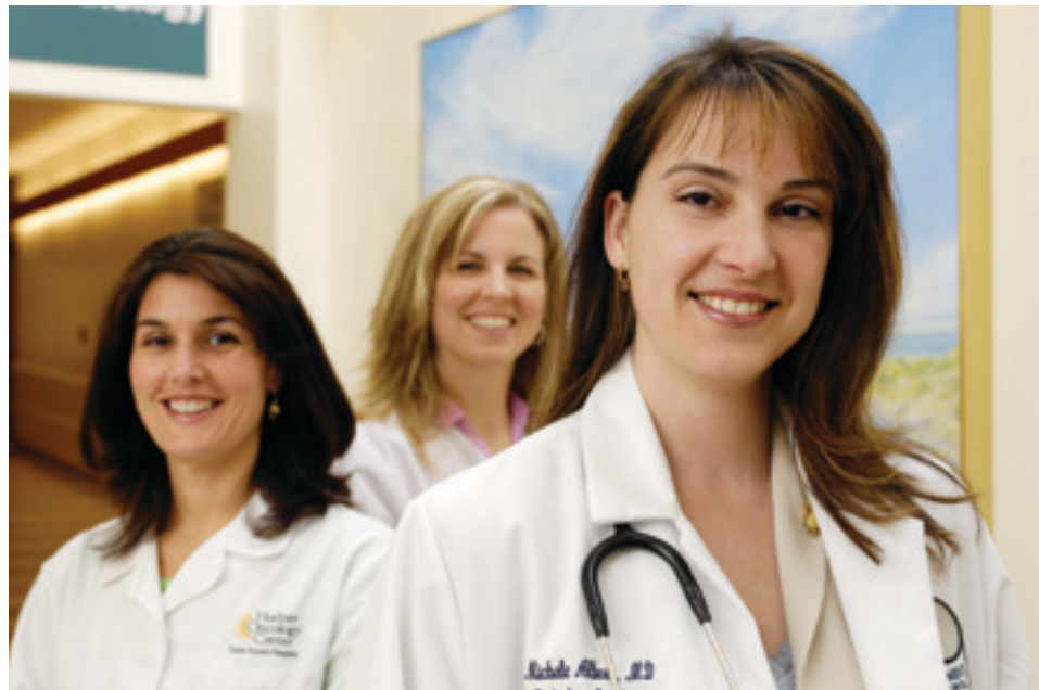
Collaboration and communication among all members of Saint Anne's highly trained and experienced cancer care team ensures high-quality care.

*named in honor of a generous donation from the Friends of Saint Anne's Hospital